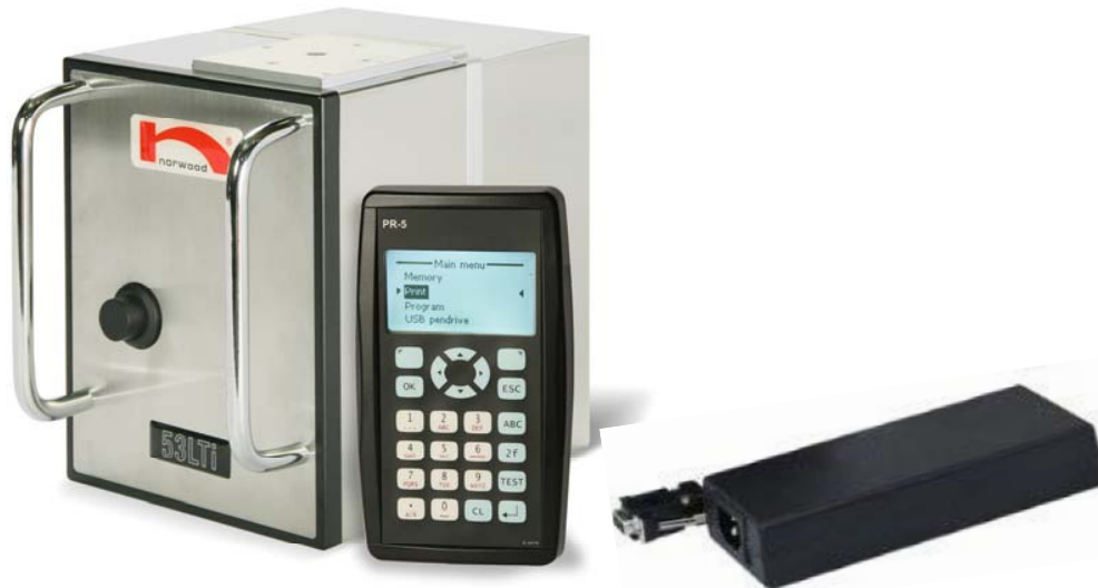
Model 53LTi shown with PR-5 Handset and Power Supply